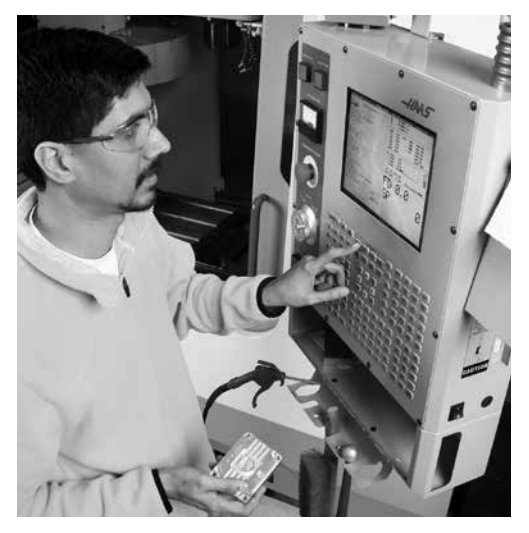
CNC Production Technician Certificate