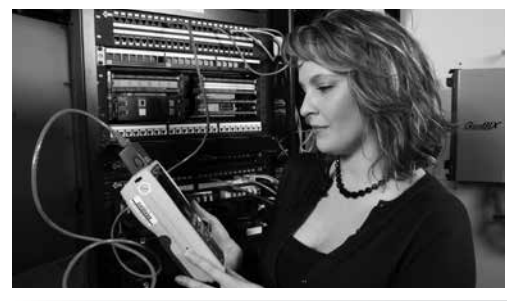
Industrial Mechanical Technician p.124